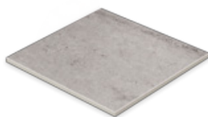
8031, 30 x 30 cm R 10