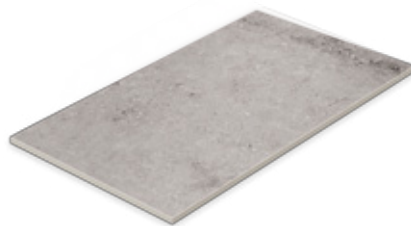
8062, 30 x 60 cm R 10