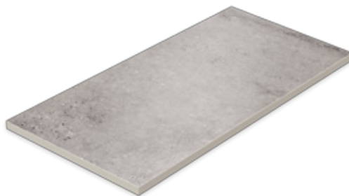
0186, Terrace slab 40 x 80 cm R 10