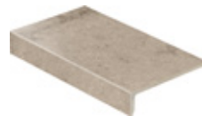
4817 loft stair tread tile®