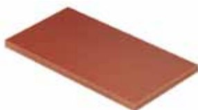
1100, 12,5 x 25 cm R 11