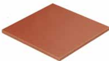
1610, 25 x 25 cm R 11